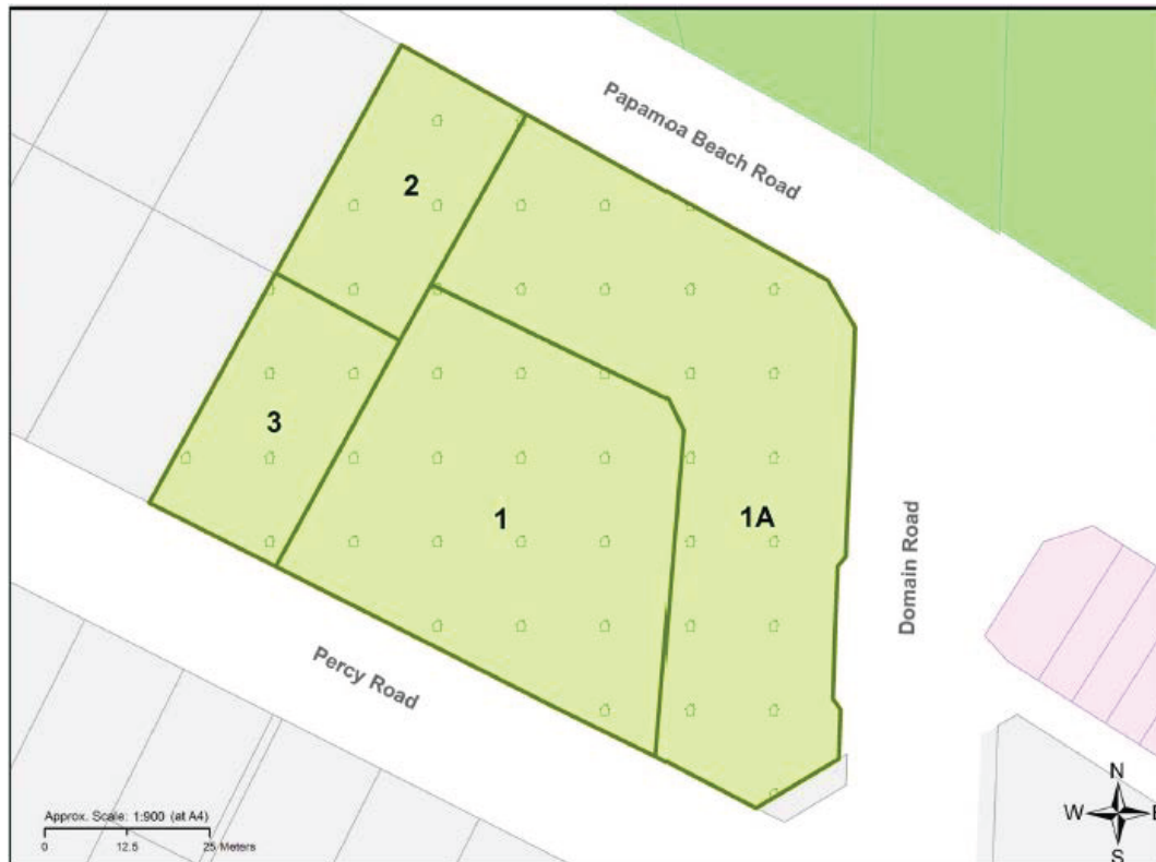
Description of Domain Road special housing area